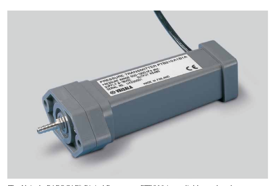
The Vaisala BAROCAP® Digital Barometer PTB210 is a reliable outdoor barometer that withstands harsh conditions.