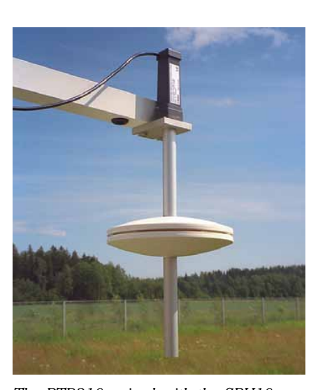
The PTB210 paired with the SPH10 Static Pressure Head.